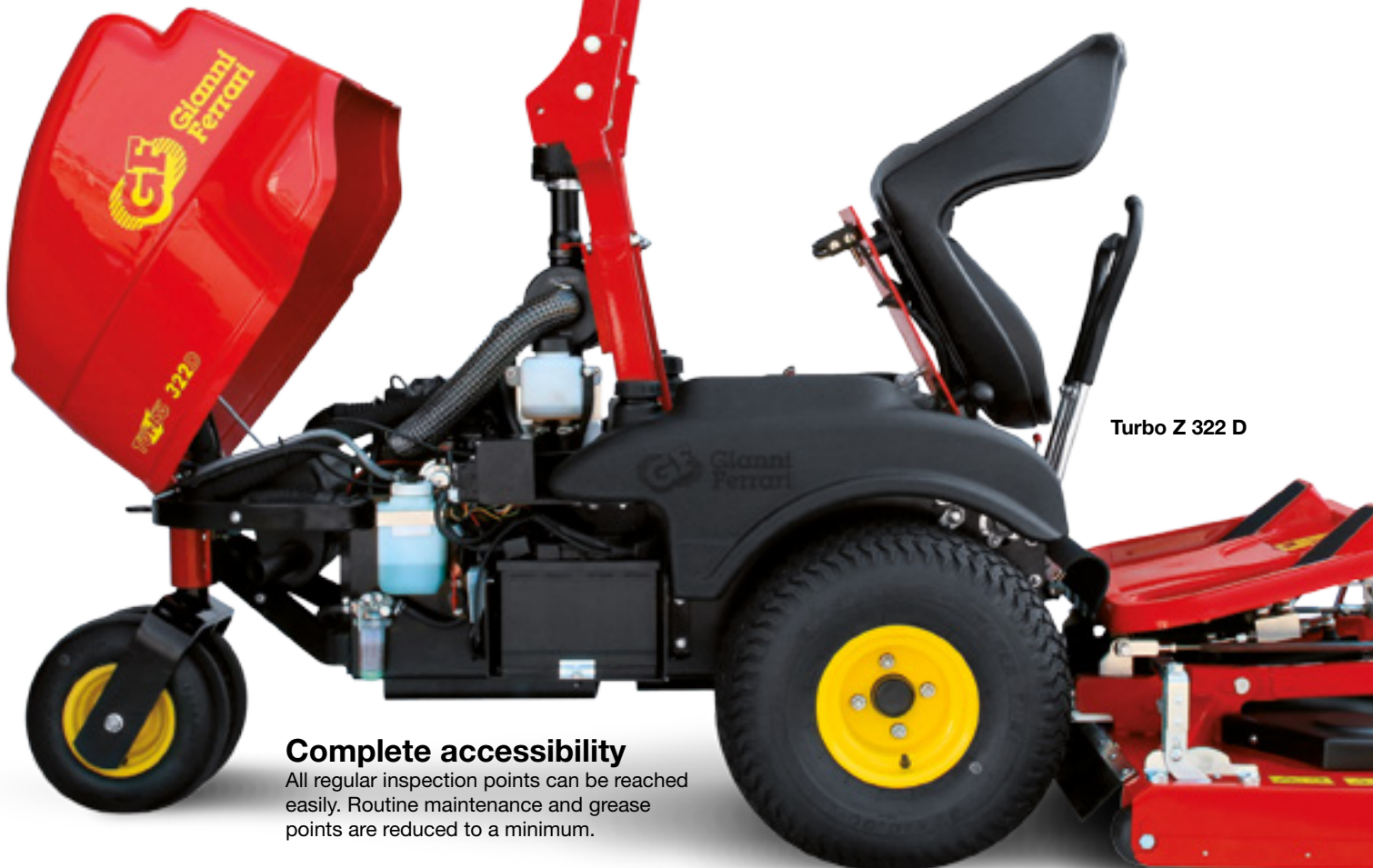
Turbo Z 322 D