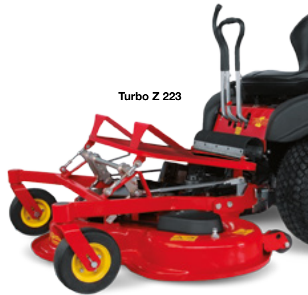
Turbo Z 223

The strong 3-cylinder diesel engine provides high efficiency, superior performance whilst reducing running costs.